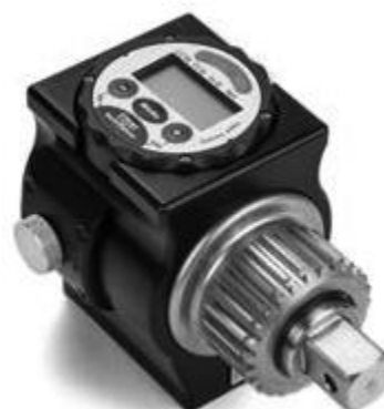
TC1 – the mobile measuring unit

Torque Control monitors the torque and thus the on-site bolting process. The system works without cables and is compatible with Plarad's current nutrunner program.