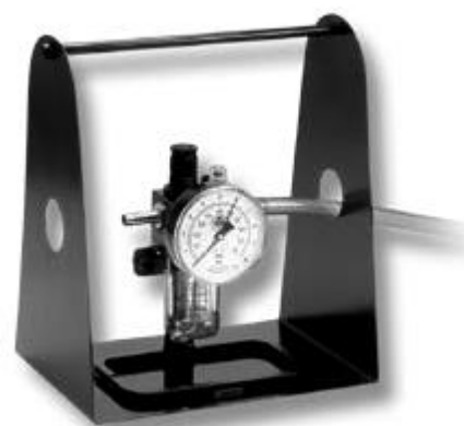
Pressure regulation unit

Torque Control monitors the torque and thus the on-site bolting process. The system works without cables and is compatible with Plarad's current nutrunner program.